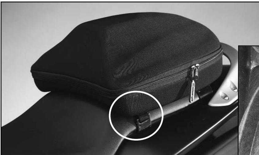
A. Secure Hooks

Check the tightness of the straps before riding. Never ride a motorcycle with loose equipment or accessories.