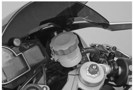
ZCap, Brake Reservoir Replacement Cap, Machined Aluminum Fits: S1000 RR

BMW TOOL REQUIRED BMW Tool, 321 510/511 Clutch Reservoir and Brake Reservoir Cap removal tool.